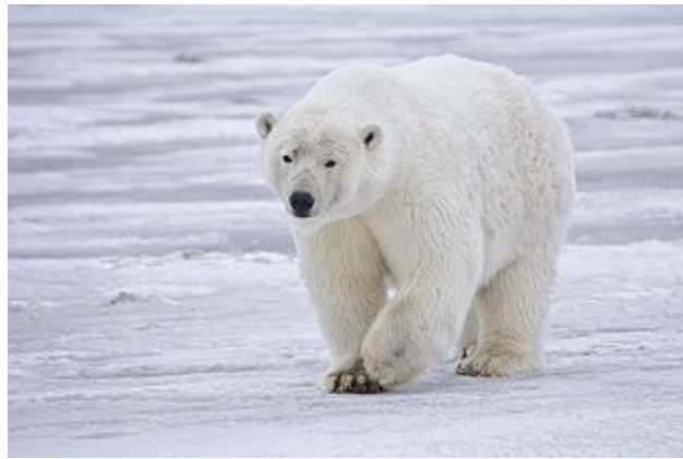
Figure 1: Polar Bear.

For this question, include an image of the animal you added to the table in Q5 along with a caption (see example below).